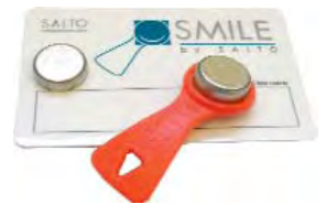
Shadow tag and iButton fob

Every user is allocated an iButton fob. Each user's fob is simply programmed into the system using the programmer fob and placed into the handle's reader. Each user fob has a shadow tag (as shown below) which is kept in a safe place. The shadow tag allows any lost or stolen fobs to be removed from the system preventing unauthorised access.